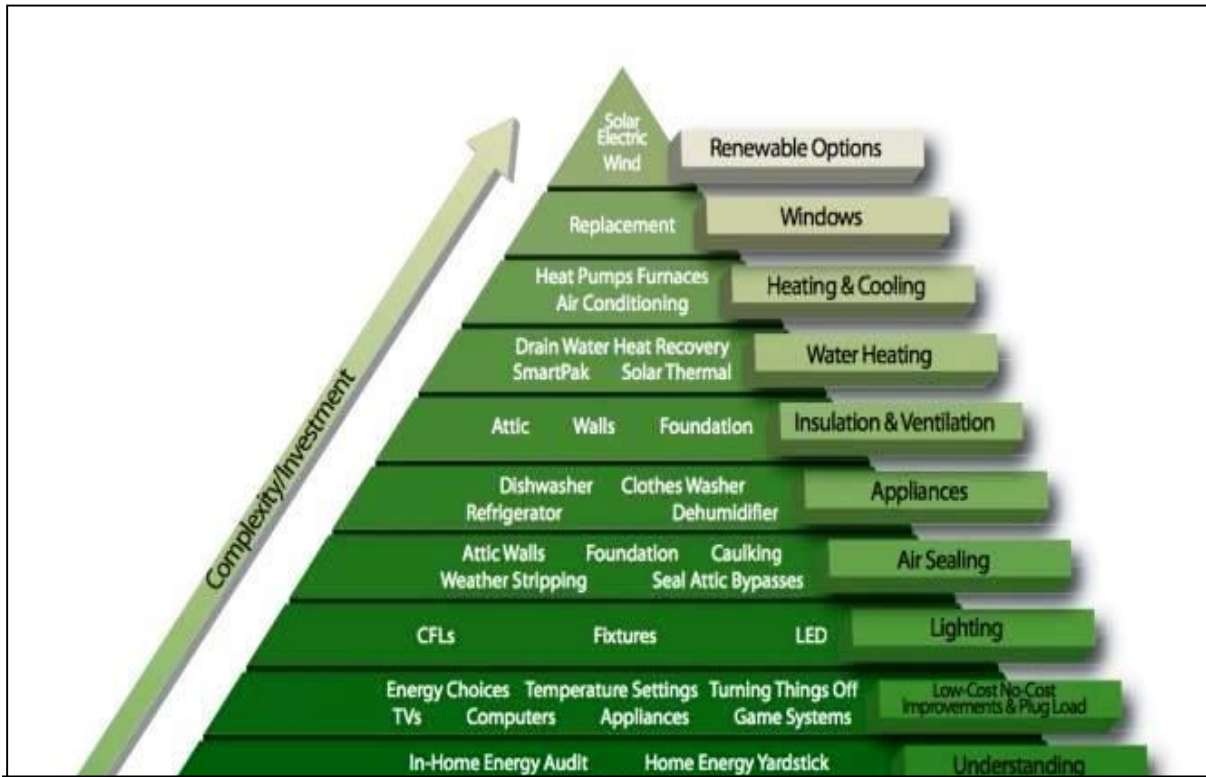
Energy Pyramid

The following diagrams provide great suggestions for actions individuals may take with regard to their own home, from everyday practices to installation of renewable energy resources: