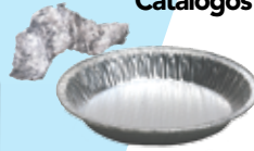
Aluminum Foil Papel de aluminio