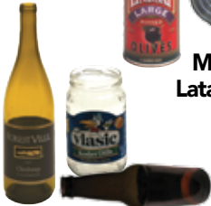
Glass Bottles and Jars Botellas y frascos de vidrio