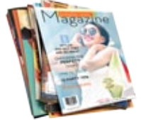
Catalogs and Glossy Magazines Catálogos y revistas elegantes

Shredded paper should be inside a stapled paper bag only.