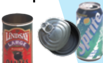
Metal Cans Latas de metal