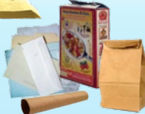
Mixed Paper Todo el papel