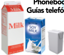
Flat and Gable-topped cartons Envases de cartón con tapas planas o tapas de pico