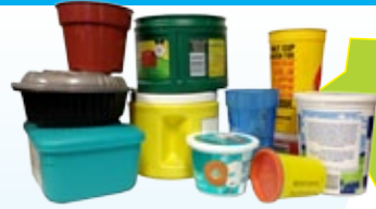
Plastic Cups and Tubs #2, #4 and #5 Vasos y recipientes de plástico